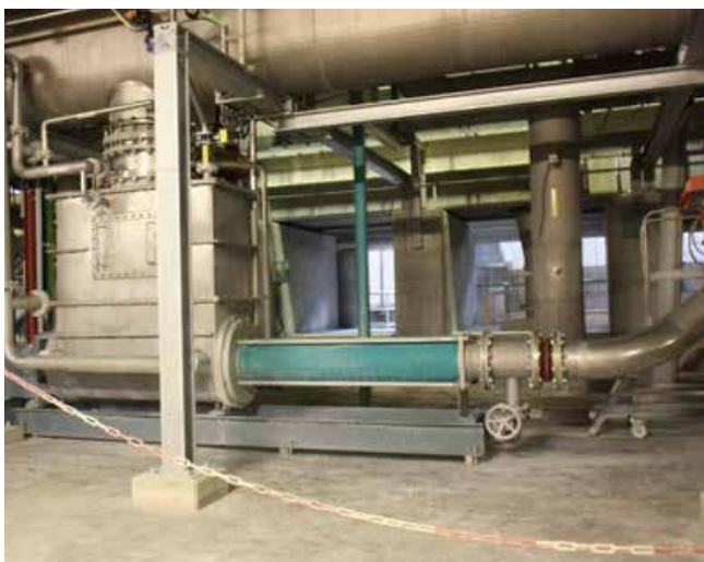
TORNADO® T1 conveying kaolin slurry

The self-priming TORNADO ® pump operates via displacement, transporting the conveyor medium continuously from the suction to the pressure side using two intermeshing rotors. Almost all types of media can be transported smoothly in this way, from low-viscosity and high-viscosity materials such as thixotropic or dilatant substances to sticky and non-sticky or shear-sensitive materials. The pump also handles particle sizes of up to 70 mm with ease. The transported volume can be regulated easily via the rotation speed. Volumes of up to 1,000 m 3 /h can be achieved depending on size.