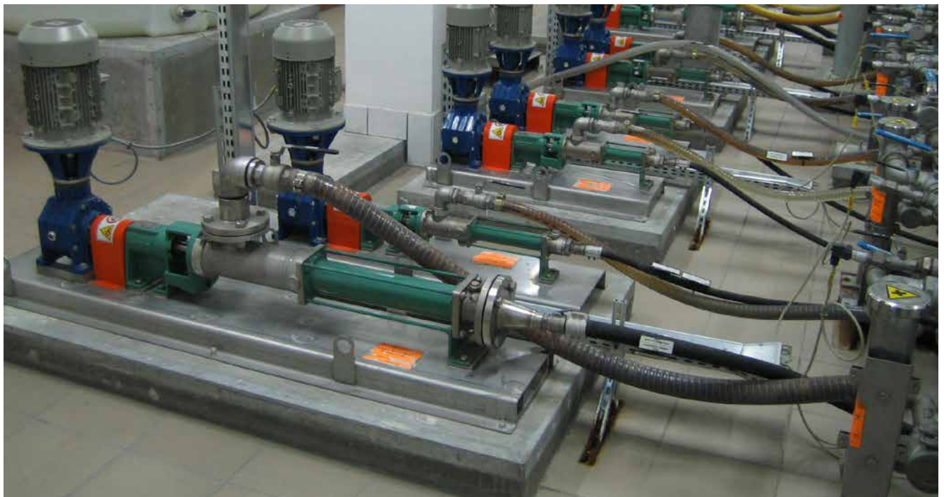
NEMO ® pumps are conveying latex dispersions

In the petrochemical industry aromatic hydrocarbons contained in the pumped fluids cause problems quite often because such substances generate swelling of stators and joint seals. The use of suitable elastomers or stators made from solid materials in NEMO ® progressing cavity pumps prevents swelling and guarantees the operational reliability of your plant.