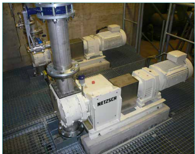
NEMO® pumps waste paper