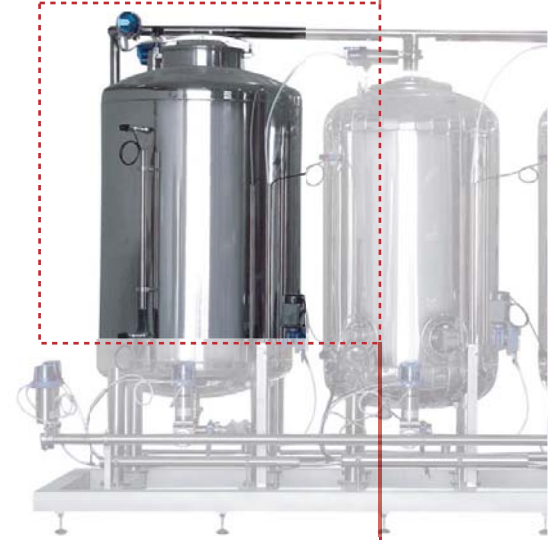
One line static CIP unit