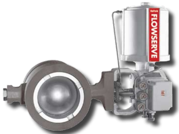
Valtek ShearStream HP