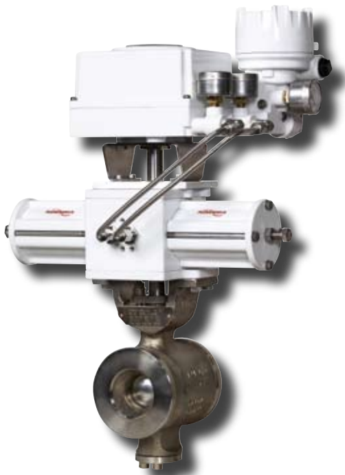
Valtek ShearStream SB

effective continuous operation. They have an extremely long life span as all parts are of highest quality. And they'll still be safe in the future as they use advanced technology and innovative solutions. Flowserve ensures a safe and cost-effective operation for our customers all over the world